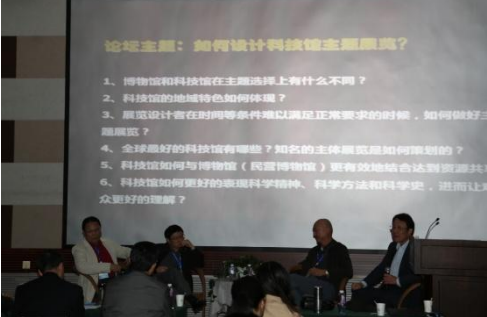
2015 The second session ( Dalian )